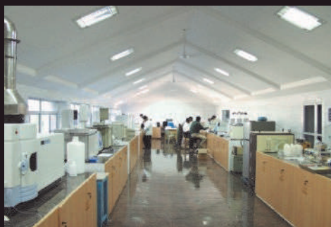
Instruments Lab - Marine sciences