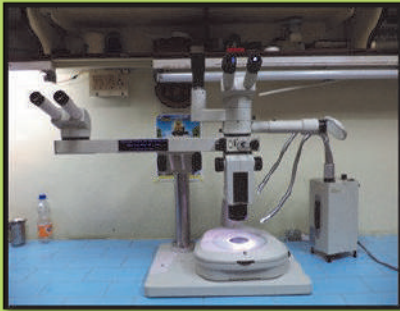
TRINOCULAR STEREOSCOPIC ZOOM MICROSCOPE