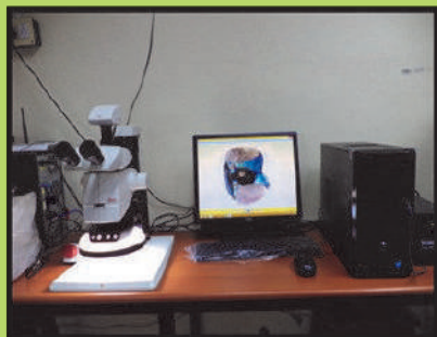
LEICA Stereo zoom microscope