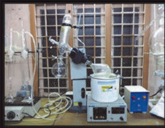
ROTARY VACUUM FLASH EVAPORATOR